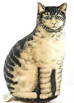
Ithaca Kitty Toy circa 2018